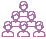
MAB Advisory Board

There are a number of people and organisations involved in delivering the Merlin Standard as well as those who are engaged in any assessment against the Standard.